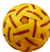
Women | /Junior